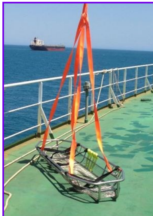
The stretcher ready & waiting in hope

Pray for their safety and their families.