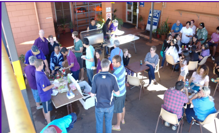
Sea Sunday BBQ

After the service we served fresh fruit salad and ice-cream to conclude the celebrations.