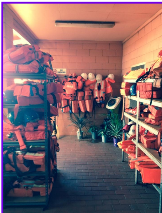
A busy afternoon, at the Centre.